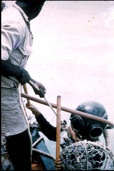
Bitingmidge, Sending a pearl diver down, Torres Strait c 1958