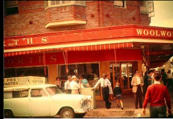
taken in the year 1959