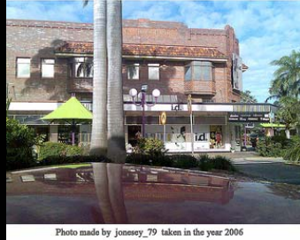
taken in the year 2006